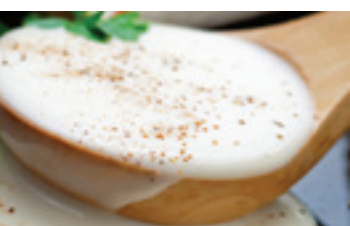
FOOD SERVICE PROCESSING PROGRAMMES

16 programmes for the production of basic pastry products such as paté a bombe, Suisse meringue and custard. Also here the control of each production cycle step is wholly automatic.