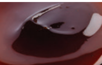
SAUCES AND TOPPING

3 automatic heating programmes for panna cotta, pudding and rice pudding. Easy TTi controls stirring, cooking time, maintaining as well as product outgoing speed.